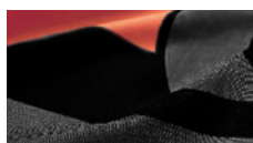
100% knitted polyester for long lasting in time.