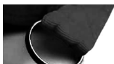
Chromed metal fixing ring.